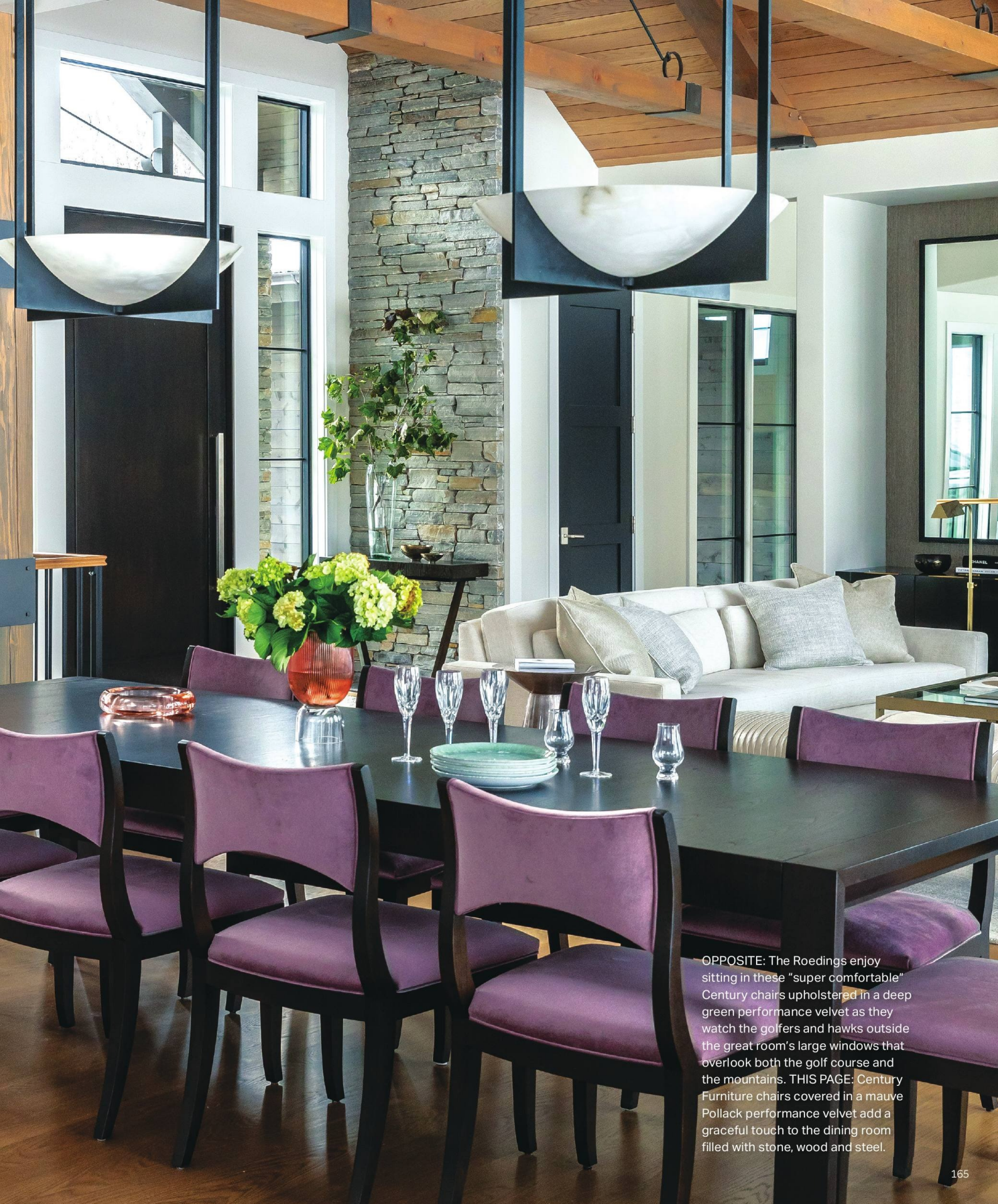
OPPOSITE: The Roedings enjoy sitting in these "super comfortable" Century chairs upholstered in a deep green performance velvet as they watch the golfers and hawks outside the great room's large windows that overlook both the golf course and the mountains. THIS PAGE: Century Furniture chairs covered in a mauve Pollack performance velvet add a graceful touch to the dining room filled with stone, wood and steel.